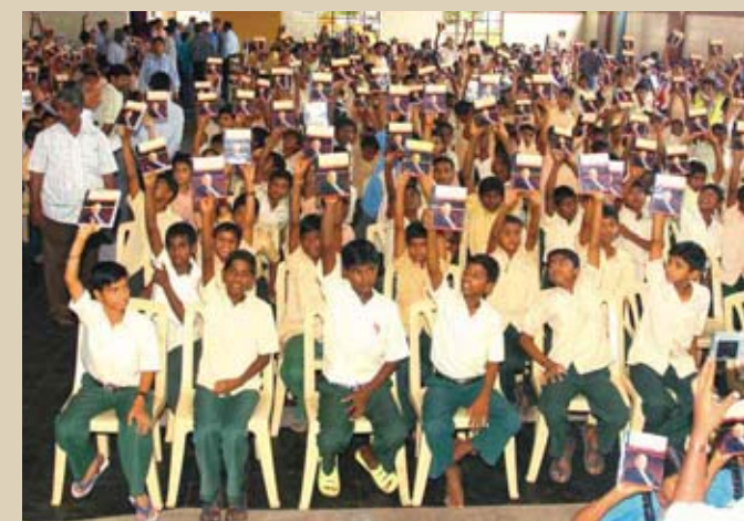
Notebooks were distributed to school children of Valmiki High School, Deepayana English Medium High School, Jaycees English Medium High School, Hospet and Vinayak Saraswathi High School.