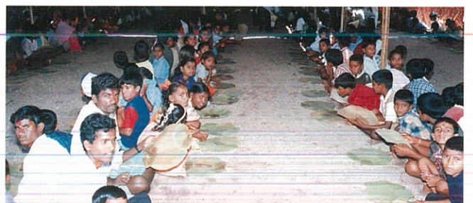
A large scale Mass Feeding was organized, in which, over 5000 people participated