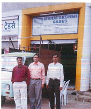
A view of Pune Depot

M/s Mahalakshmi Gases, Ichalakaranji, a Group Business enterprise started company sales Depots at Pune and Bijapur on 22.07.2004 for Industrial Gas consumers.