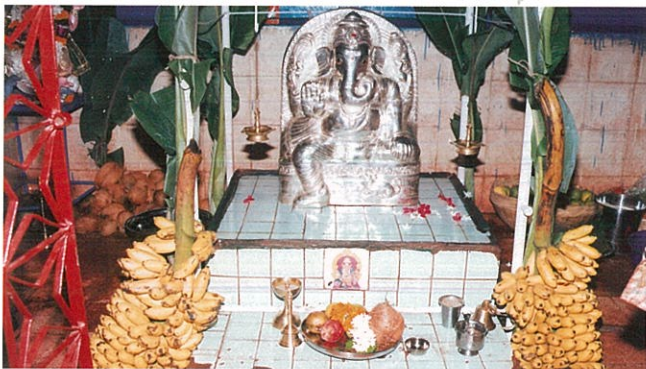
New Silver covering for Lord Ganesh

Tradition, Culture and Festivals find a special place at MSPL. This festival was celebrated grandly on 18.09.2004. On the auspicious day, a special Pooja with Homa was conducted in the Ganesh Temple at Vysanakere Iron Ore Mines. Employees of MSPL and people from nearby villages gathered at the temple to seek the blessings of Lord Ganesha.