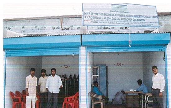
A view of Bijapur Depot