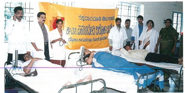
A view of Donating the Blood

As a part of Jaycee Week Celebrations from 08 th to 15 th August 2004, Hospet. Jaycees Club Members conducted blood donation camp organized by Smt. Vasantidevi Baldota Blood Bank, Hospet. on the occasion of Independence Day Celebration in Jaycees School Premises