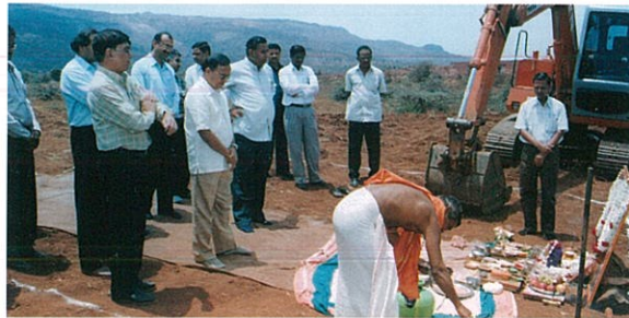
Bhoomi Pooja of MSPL Export.

The company promotes of New Partnership Company – MSPL Exports is established to produce high value products which can be exported after crushing, Screening and Beneficiation at the location specially selected.