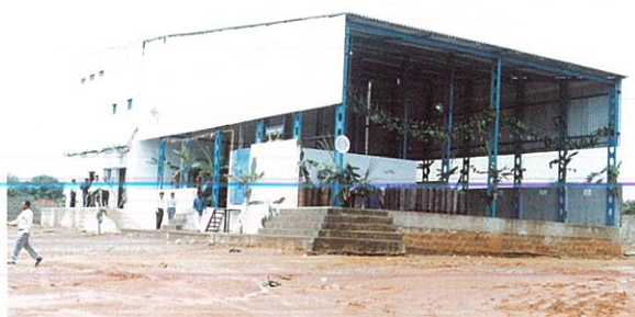
A view of Ramnagar Plant