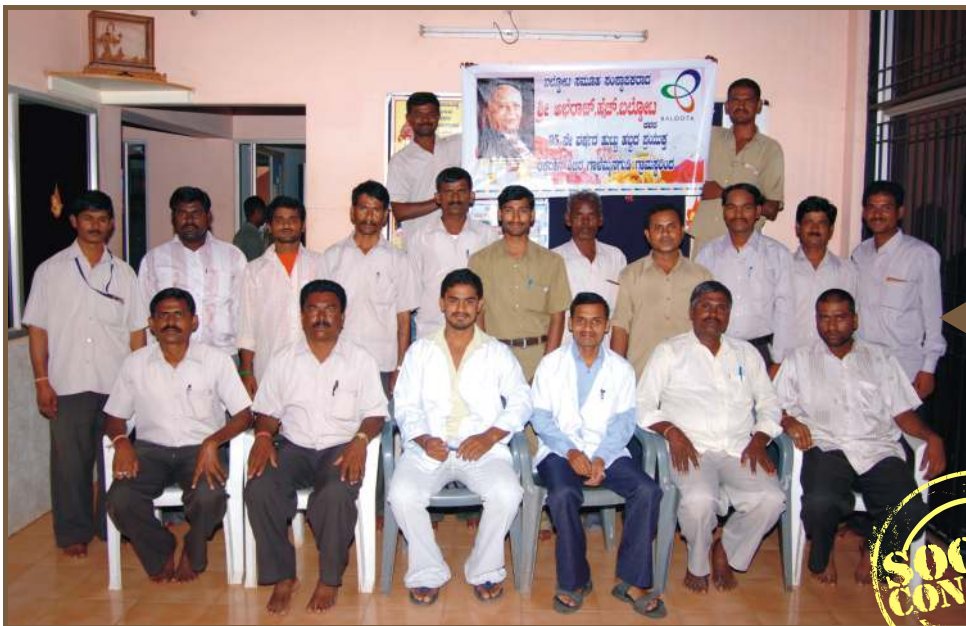
Blood donation by Baldota Group employees on Founder's Day