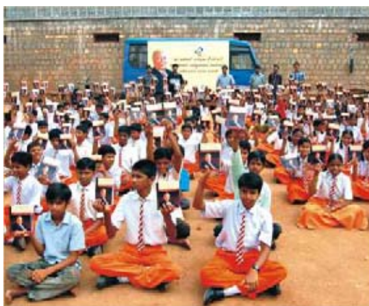
School students of Kotturuswamy High School