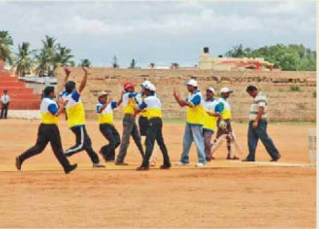
Players celebrating the dismissal of wicket with great enthusiasm.