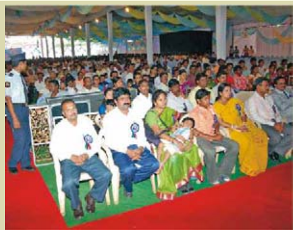
Employees of the Baldota Group along with their family members watching performances with rapt attention on 2nd Founder's Day.