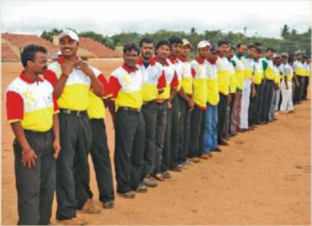
PVS Mines and SIOM team players during the inaugural function of Baldota Group Cricket Tournament.