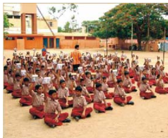
School students of Mahila Samaja High School.