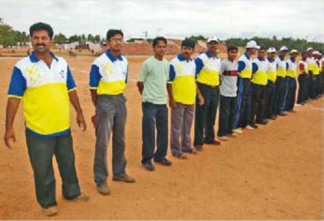
Players of Corporate "B" Team during the inaugural function of Baldota Group Cricket Tournament.