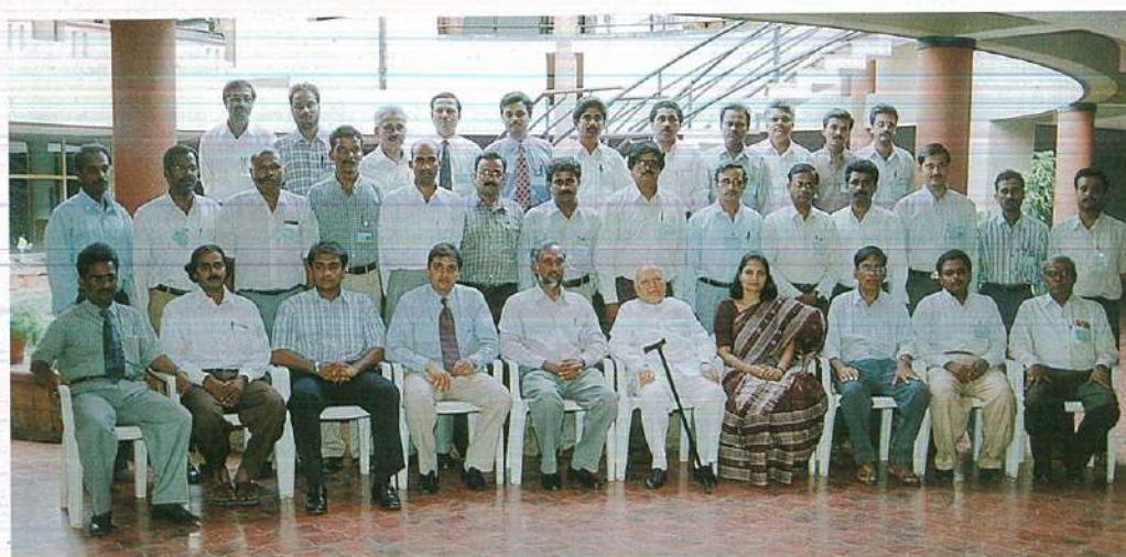
Programme on Creativity for Organizational Transformation conducted by the Administrative Staff College of India

The power of creativity is a potent and proven tool in breaking existing mind-sets and ushering a sea change. We are a growing company in a rapidly changing environment. To change with the changing times, a workshop on "Creativity for Organizational Transformation" was organized from 30th