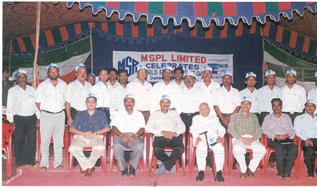
Mines Staff actively participated in World Environment Day