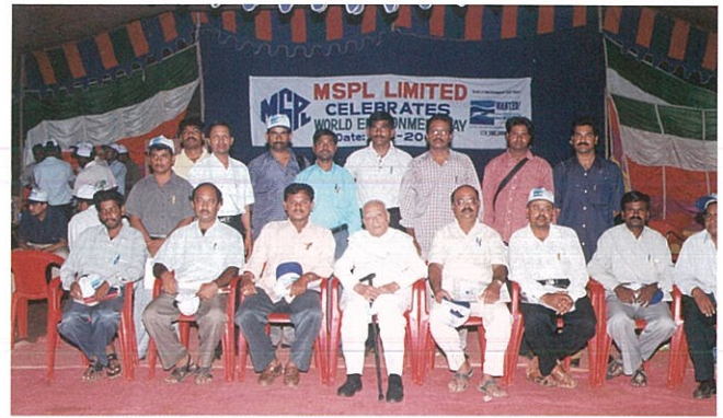
Media Personnel participated in World Environment Day