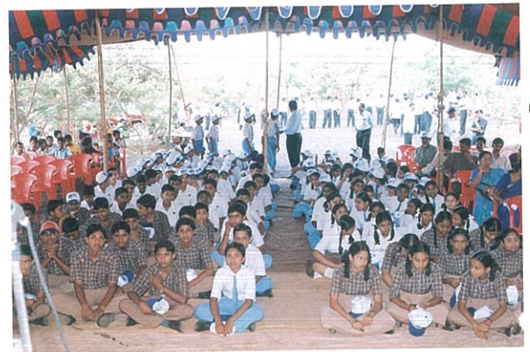
View of School children participated in World Environment Day Celebration.