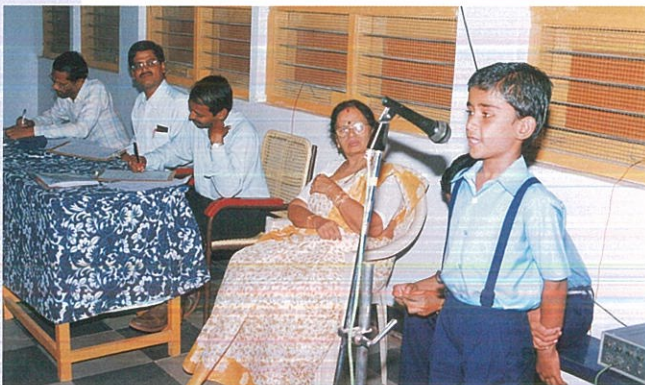
Elocution competition in Progress at Deepayana School.