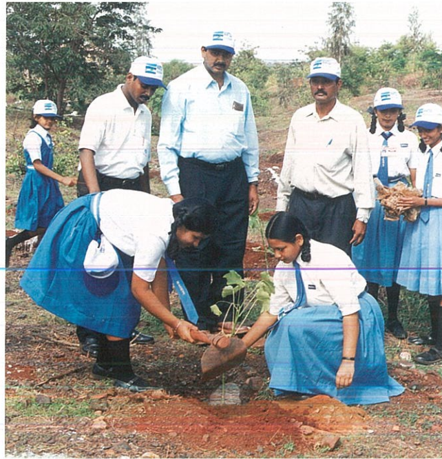
Students participating in Plantation programme.

YOUNG TALENT DISPLAY SKILLS ABOUT ENVIRONMENT