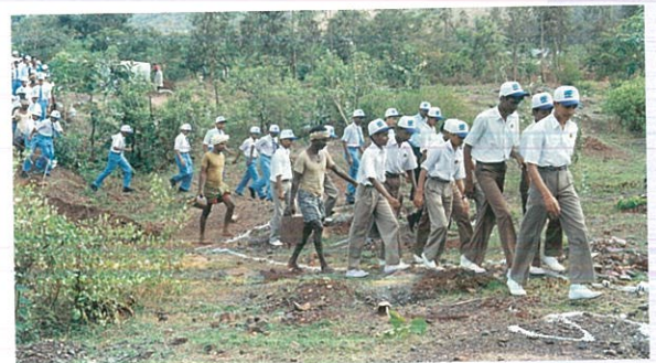
School children getting ready to participate in Plantation Programme.

Everyone gets advice. Only the wise benefit from it.