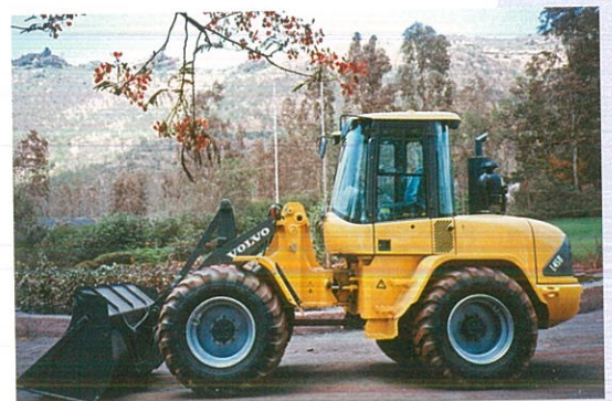
View of 2 Wheel Loaders