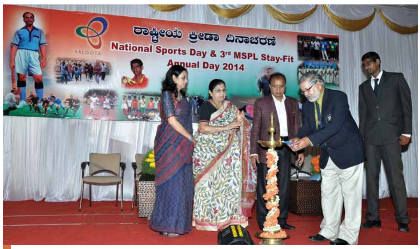
Inaugurating National Sports Day 2014

Mr. Beedu then conducted a fitness training programme for the employees and their families the next day.