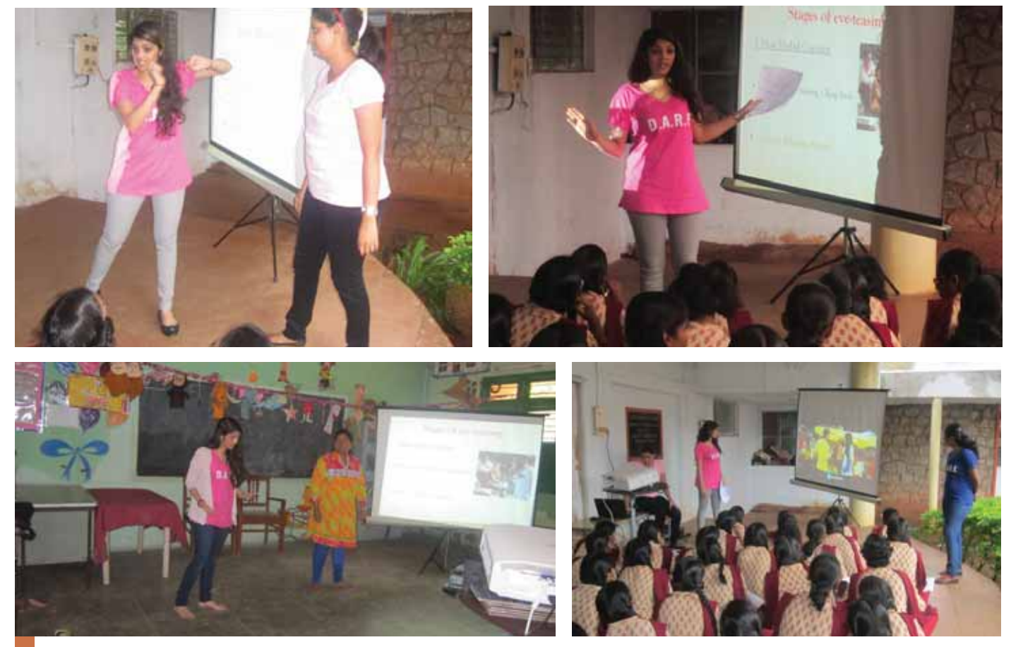
Learning to stand up for themselves.

These sessions have already reached more than 1,200 women, and will be introduced in more schools and colleges as a regular feature. So, you can ask yourself, do you have what it takes to DARE?