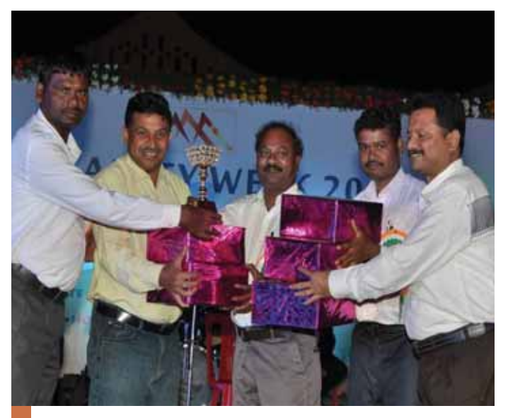
VIOM team receiving the 1<sup>st</sup> Prize for First-Aid Competition at the Zonal level.