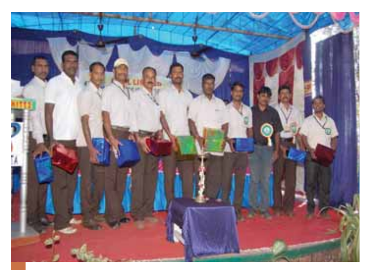
The victorious 'Kabbadi' team.