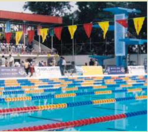
Venue for the 23rd National Aquatic Championship co-sponsored by MSPL Limited.

MSPL co-sponsored the 23rd Sub-junior National Aquatic Championship, 2006 which was conducted by the Karnataka Swimming Association from 18th-21st lune at the swimming complex of lain International Residential School (JIRS), located about 40 kms from