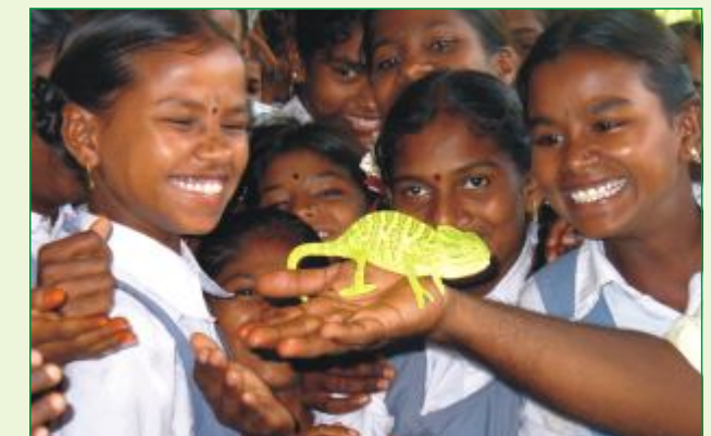
Students of B.G. Halli are enthralled to hold a chameleon in their very own hands