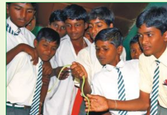
The Students at GPU College, TBDam holding a live Vine snake.