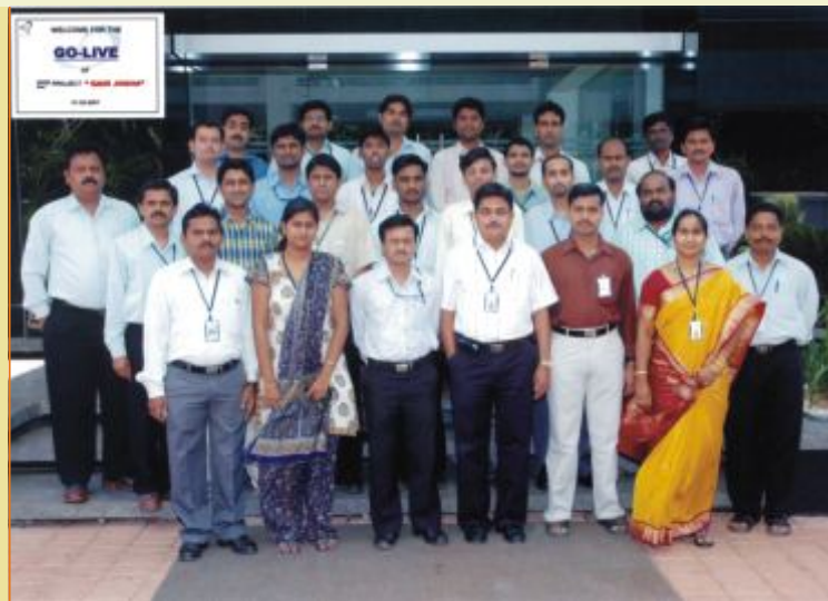
The SAP team of Baldota Group at the Go-Live of project "Gani Jnana"