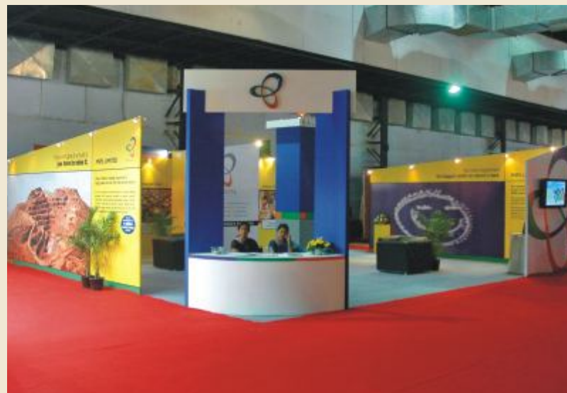
Baldota Group Pavilion at the JITO Multi-Trade Fair held in Mumbai from 4th to 7th January, 2007.

The beginning is the half of every action.