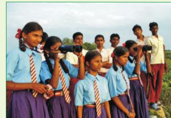
Girls at Ramasagar lake watching birds.